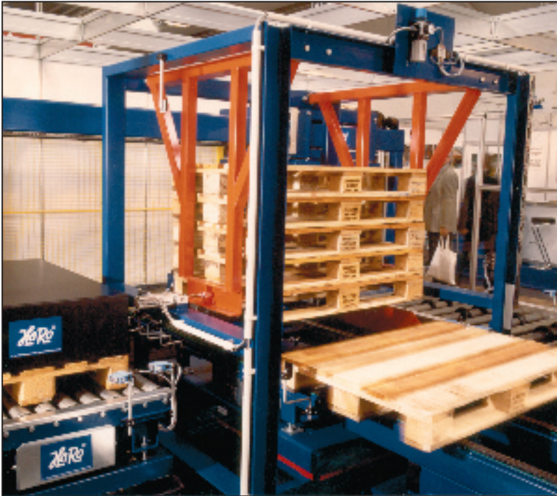
Stacking magazine (Euro pallet) with pneumatic grips