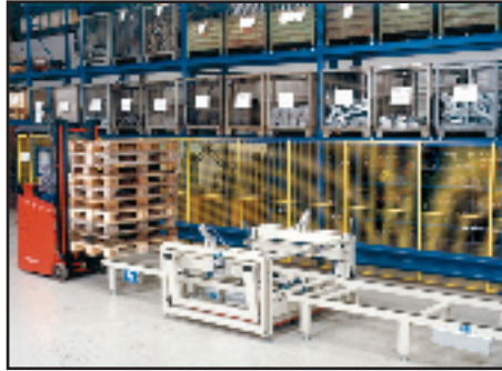
Lifting of one stack