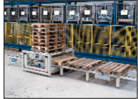
Delivery of single pallets

A pile of empty pallets is positioned on the conveyor via a lifting truck or a fork lift truck. The pallets are stacked either via a vertical lifter installed below (lifting table or by an eccentric lifter positioned above) and via the pneumatic support arms which grasp the pallets from above. The pallets in the stack are lifted in this process. The new