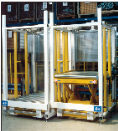
Stacking magazine for special cages with pneumatic grips and lifting table