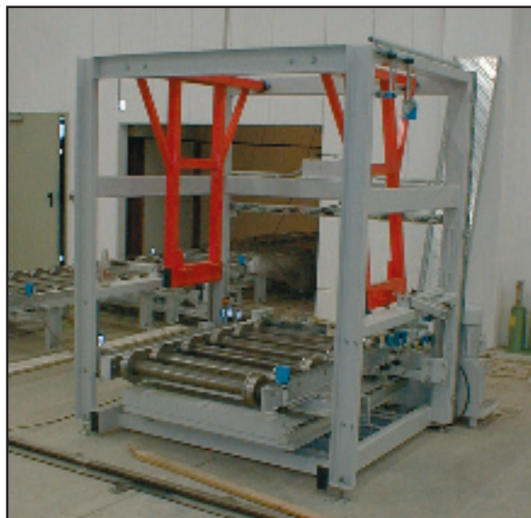
Stacking magazine for Euro pallets